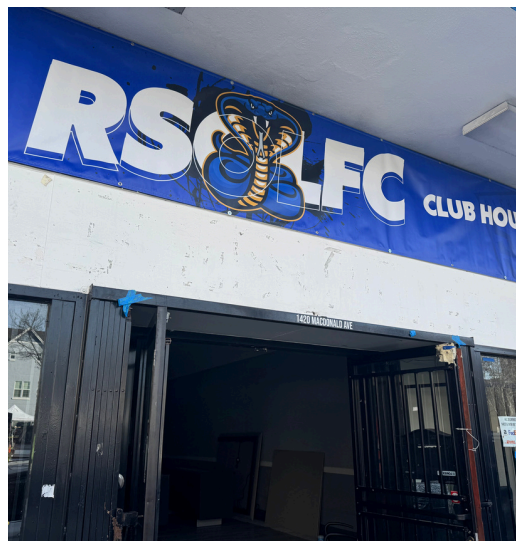
Richmond SOL 1420 Macdonald Ave. Please Call for more information (510) 965-9697 richmondsol.org