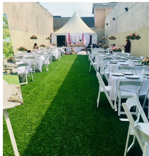
Leftside Event Space 1410 Macdonald Ave. Please Call for more information (510) 965-9697